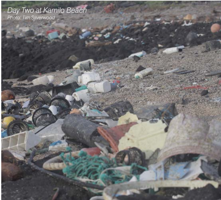
Day Two at Kamilo Beach

In 2011 Silverwood sailed 5000km through the North Pacific Ocean on an international research expedition through one of the most polluted areas of ocean on the planet. Known as the great Pacific Garbage Patch, this area is a massive accumulation of plastic waste twice the size of France. “I went to Hawaii and I joined a 72-foot sailing vessel with 12 other people,” says Silverwood. “We spent about 23 days sailing from Honolulu to Vancouver doing scientific research. We had people from Korea, North America and the UK.”