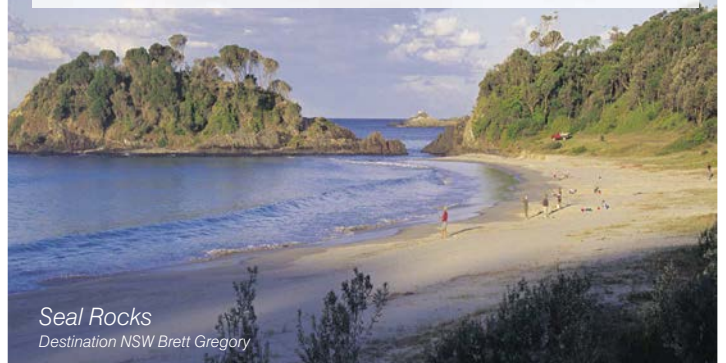
Seal Rocks

"Set amidst the Great Ocean Road, Wye River is the perfect spot to stop and explore the surrounding beaches and national parks. Be sure to check out the stands of giant Californian Redwoods in the nearby Aire Valley."