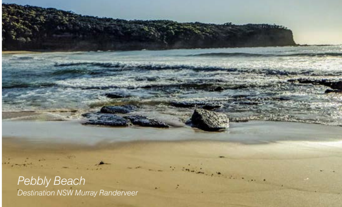
Pebbly Beach Destination NSW Murray Randerveer

"A jewel of the South Coast of NSW. The campground is teeming with wildlife and the beaches surrounding are spectacular."