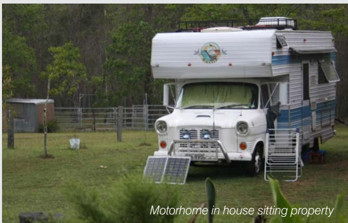
Motorhome in house sitting property